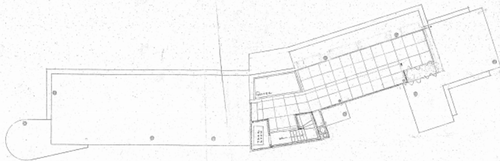
R O O F P L A N