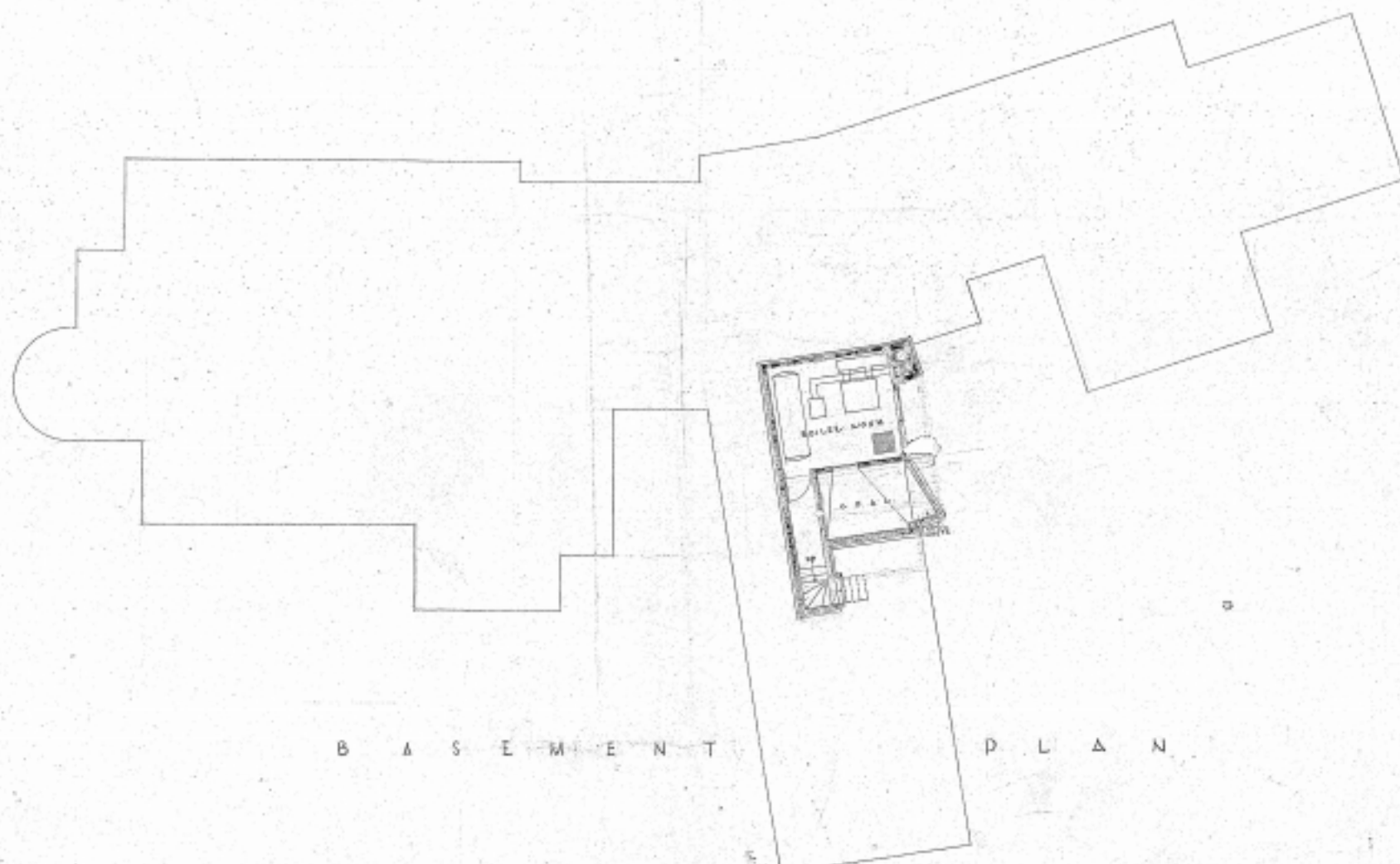
B A S E M E N T P L A N