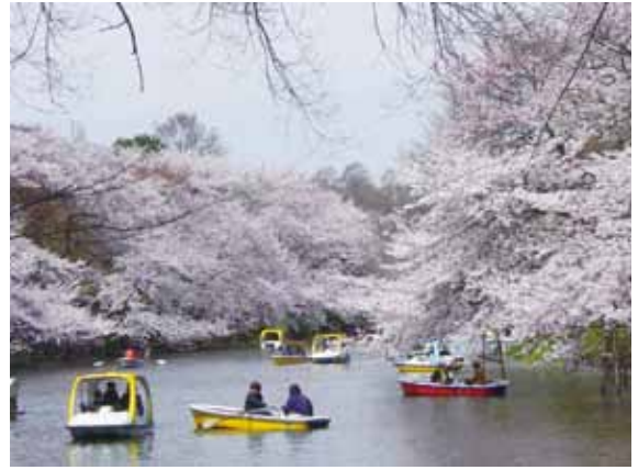
Cherry trees lining the pond