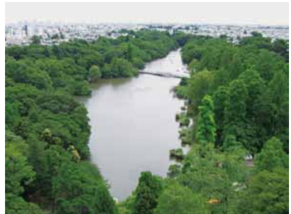
Full view of Inokashira Pond

Inokashira Pond ● This large pond stretches across the park from east to west. It boasts a large volume of water, comparable with that of Zenpu-kuji and Sanpoji Ponds, and excellent water quality. Inokashira Pond was once known as Nanai (seven well) Pond for its seven springheads; thus the bridge that spans the center of the pond is called Nanaibashi Bridge. The bridge provides an excellent view of Inokashira Pond and its aspects that change season-by-season.